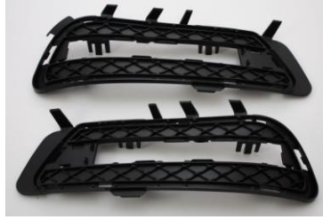
(2) Daylight net support