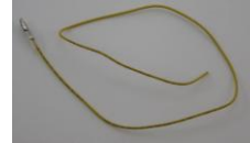
(7) Cable D