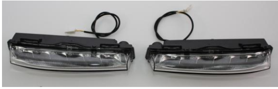
(1) Daytime running light

The following parts are included in the kit of W212 daytime running light: