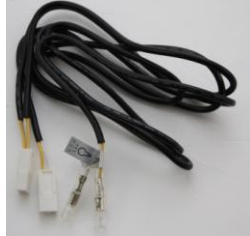
(5) Cable B