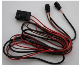
(6) Cable C