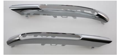
(3) Chrome molding